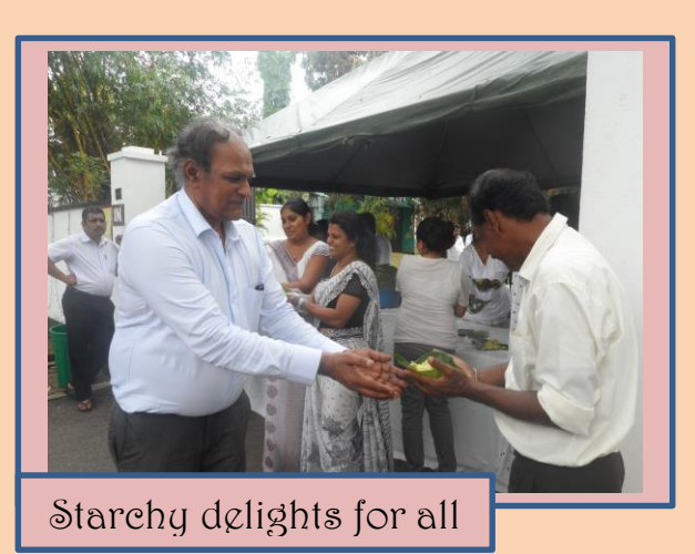
Agrarian Newsletter 2018