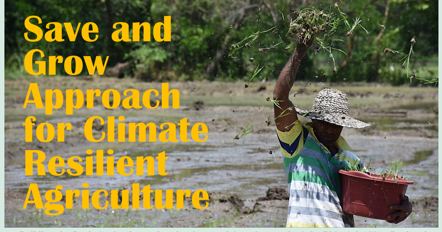
Building the Basis for Implementing the Save and Grow Approach of the FAO of the UNs: Regional Strategies on Sustainable and Climate Resilient Intensification of Cropping System

The current proportion of intensive crop production will be a threat for the sustenance of the resources and associated eco-systems, as fulfilling the needs of the new millennium with the rising global population and patterns and habits of food consumption pose a huge challenge. In order to achieve sustainability in crop production system in future, agriculture should be transformed to a system that meets production and productivity targets while saving the limited resources and inputs associated with. Hence, a new approach of save and grow emerged in the agriculture sector.